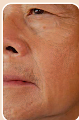
After one Matrix IR Tx