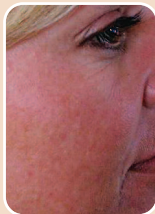
After one Matrix IR Tx