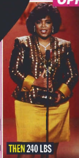
THEN 240 LBS