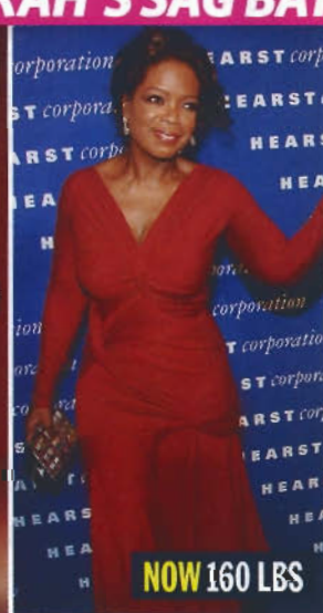
NOW 160 LBS