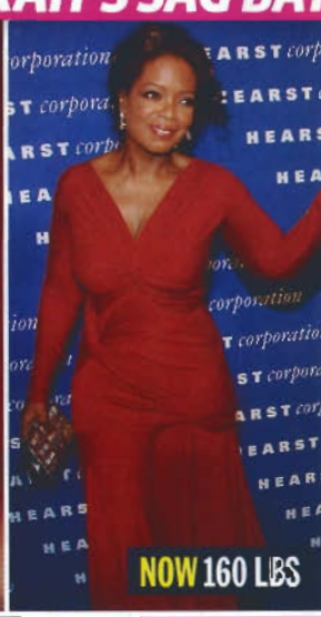
NOW 160 LBS