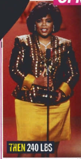
THEN 240 LBS